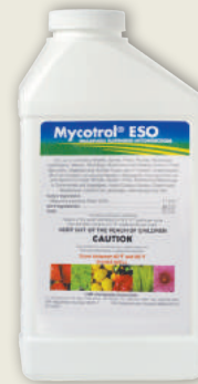
Sizes: 1qt, and 1gal.