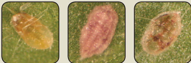
Treated whitefly nymphs