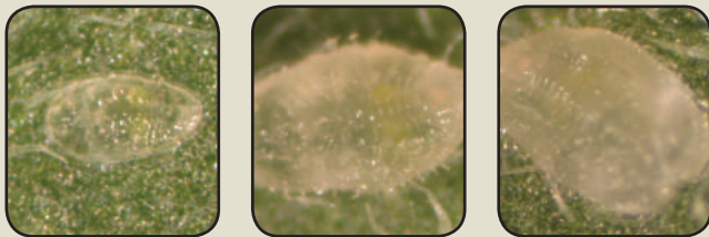
Untreated whitefly nymphs

Mycotrol's mode of action is unlike any conventional insecticide. The applied spores infect directly through the outside of the insect's cuticle (the skin). Spores adhering to the host will germinate and produce enzymes that attack and dissolve the cuticle, allowing them to penetrate the skin and grow into the insect's body. As the insect dies, it will change color to pink or brown, and eventually the entire body cavity is filled with fungal mass. The most common visible indication of insect death is a discoloration of the immatures. It is not necessary for a white fungal growth to be visible to know the product is working; the insect is killed before this happens.